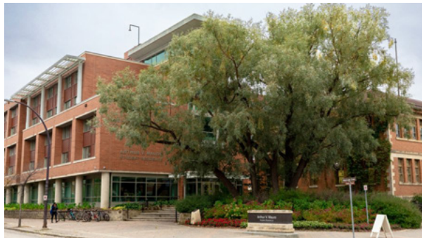
Arthur V. Mauro Residence Single room in two-bedroom suite with washroom; optional meal plan

The closest residences to the Drake Centre are Arthur V. Mauro, Mary Speechly Hall or Pembina Hall residences. Students living in residence must pay council and programming fees of approximately $150. There is a surcharge for students staying over the December/January holiday break. Historically, the majority of exchange students have lived in Arthur V. Mauro.