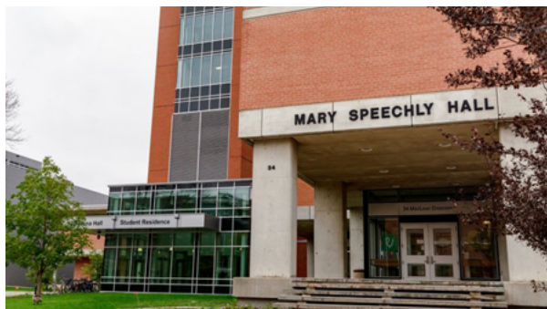
Mary Speechly Hall