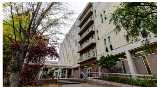
University College Residence Single or double room; includes meal plan