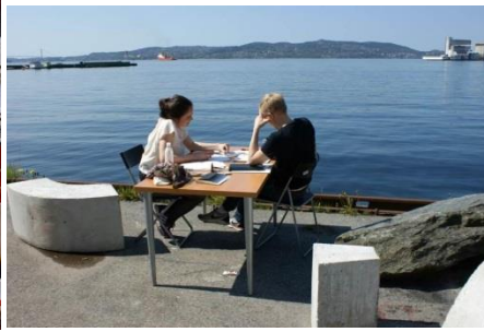
From the quayside