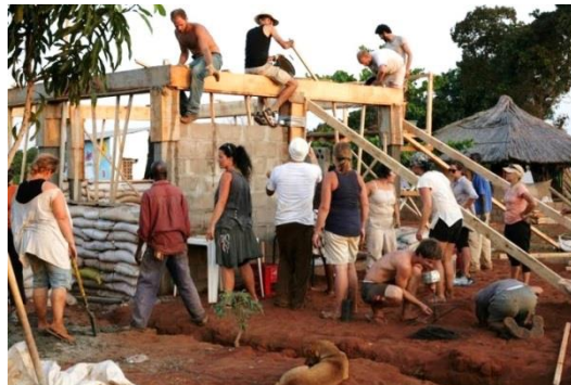
Master class studio in Mozambique, "design and build"