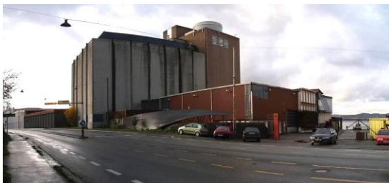
The Bas building

The BAS school building is located in an old mill/factory; about 20 minutes' walk from the historic city center of Bergen. The students have their studios spread over 6 floors, together with some lecture - and exhibitions rooms. Each class/course has its own studio. We have a workshop with different type of tools. We have a printing room, a library and a caretaker. The school has wireless internet connection.