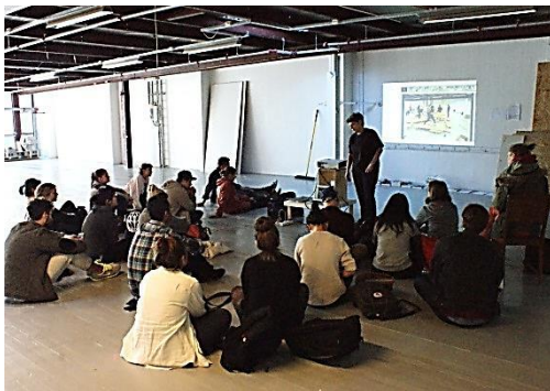
Reviews at BAS