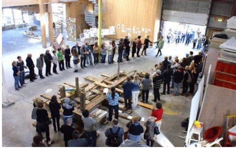
Welcoming of new students