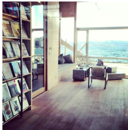
From the Library