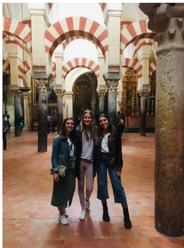
Cordoba, visiting friends