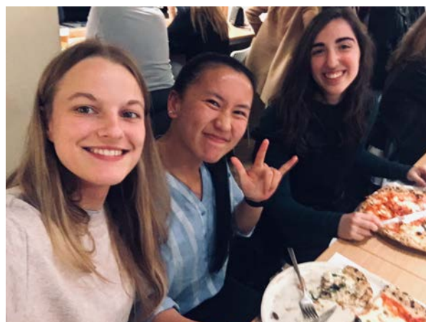
Pizza Napoli with my Taekwondo girls