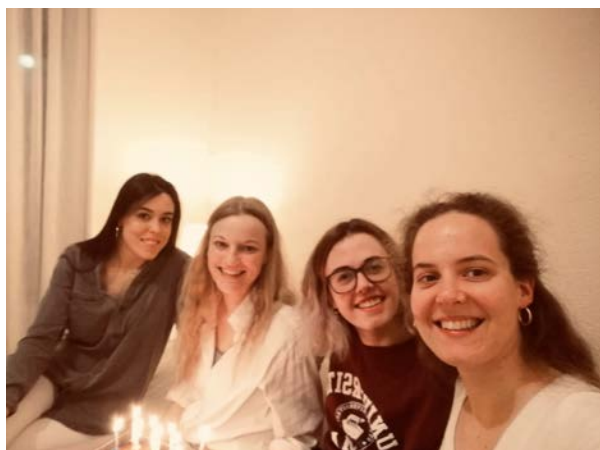
Birthday celebration with my wonderful roommates

The cheapest way to travel out of Madrid are buses. They leave regularly from Moncloa and bring you to any city within a few hours. If you want to travel further there are trains available but they cost a lot more and be careful when packing here, they also do security screenings similar to airports.