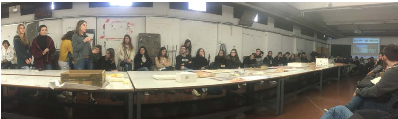
Proyectos presentation - 110 students