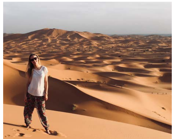
Marokko, Erg Chebbie

I recommend the English class. It was a fairly easy class but that was the intention. There is the option to miss classes and just take a final exam at the end of the semester although I would recommend going to classes. You meet wonderful people and Erasmus students with a great english have failed the exam during my stay since it focuses on the professional english in architecture.