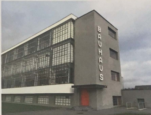
Bauhaus foundation building

von Hochschule Anhalt Dessau an der Gastinstitution Hochschule Anhalt Dessau zu senden an die Universität Liechtenstein, International Office Postadresse Fürst-Franz-Josef-Strasse 9490 Vaduz gesamter Studienaufenthalt von 02.10.2017 bis 31.03.2018