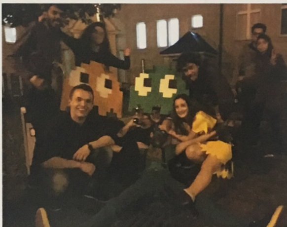
Halloween party at the university

There are several bars, restaurants, and cafes with good prices. The cafeteria is located close to the DIA department and its best solution for students who live far from the university because the food is pretty good and not expensive. There is also the gym that you can attend only for 30 euros per semester. Occasionally, the parties or drinking games are held at the university. Nevertheless, if you seeking an exciting nightlife you can easily get to Berlin. It takes approximately 1.30 hours to get there by train or Flixbus.