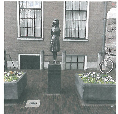
Ann Frank Museum