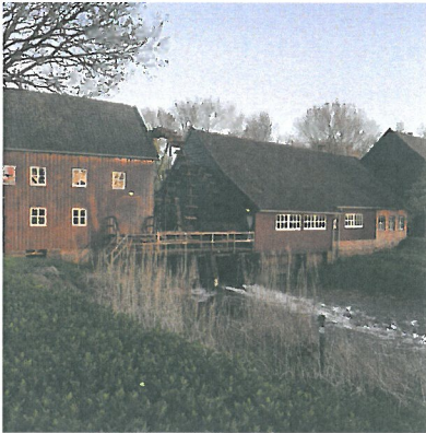
Van Gogh's Watermill