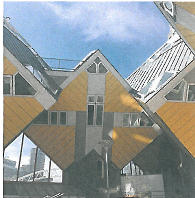
Rotterdam Cube Houses