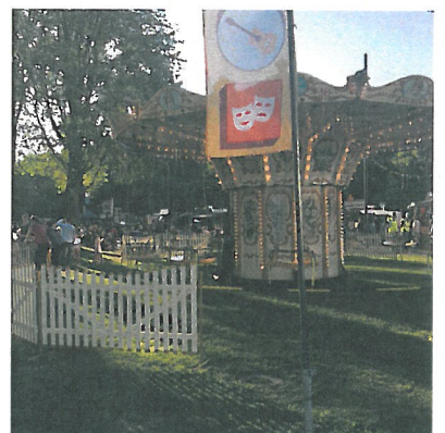
Food stock Festive @ Tu/e campus