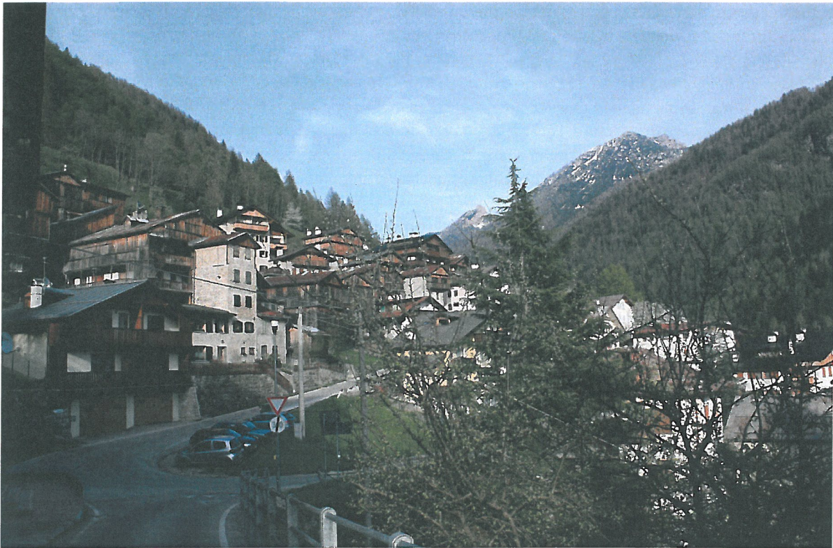
Studio trip to Fornesighe, Italy