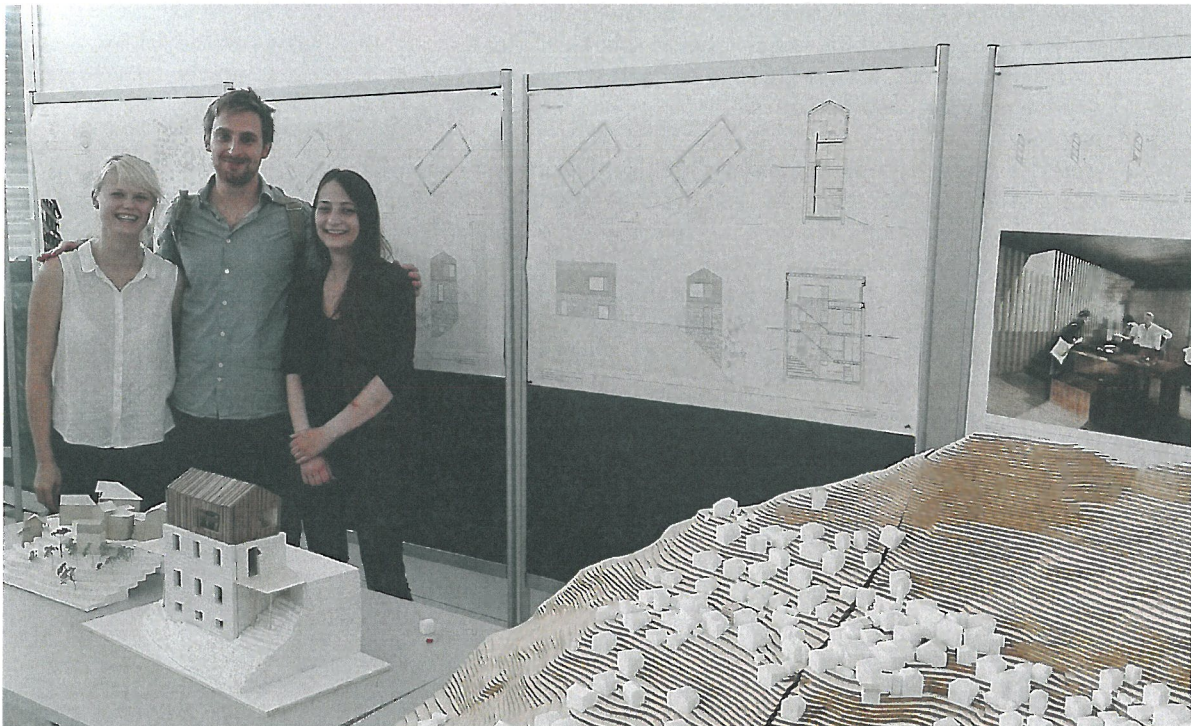
Team of the project